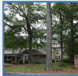
Presley Woods 40 units