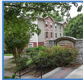
Welcome House 209 units

3Keys owns five properties throughout metro Atlanta, and manages several apartments for a program within the Adams House apartment complex.