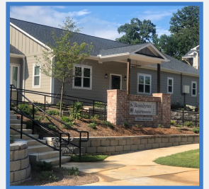
Rosalynn Apartments 56 units