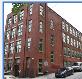
O'Hern House 76 units