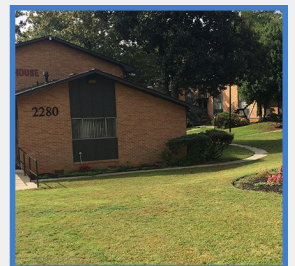
A Way Home 27 units Adams House