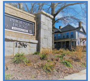
Phoenix House 69 units